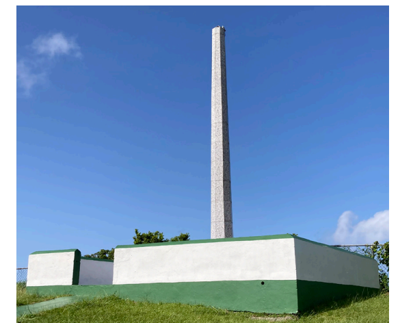
The monument to Chatoyer on Dorsetshire Hill