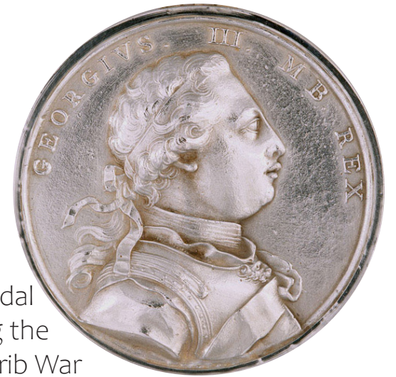
A medal commemorating the First Carib War