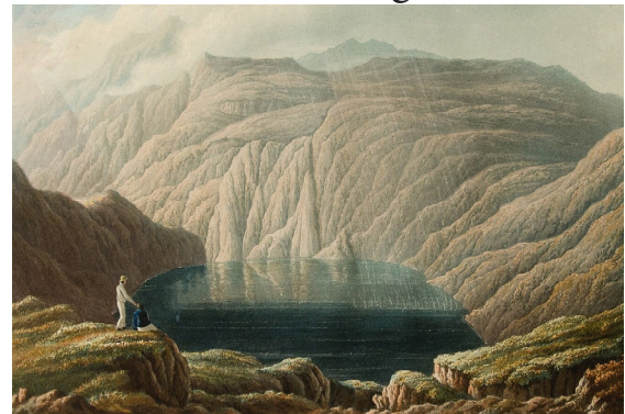
The crater of La Soufrière in peaceful times