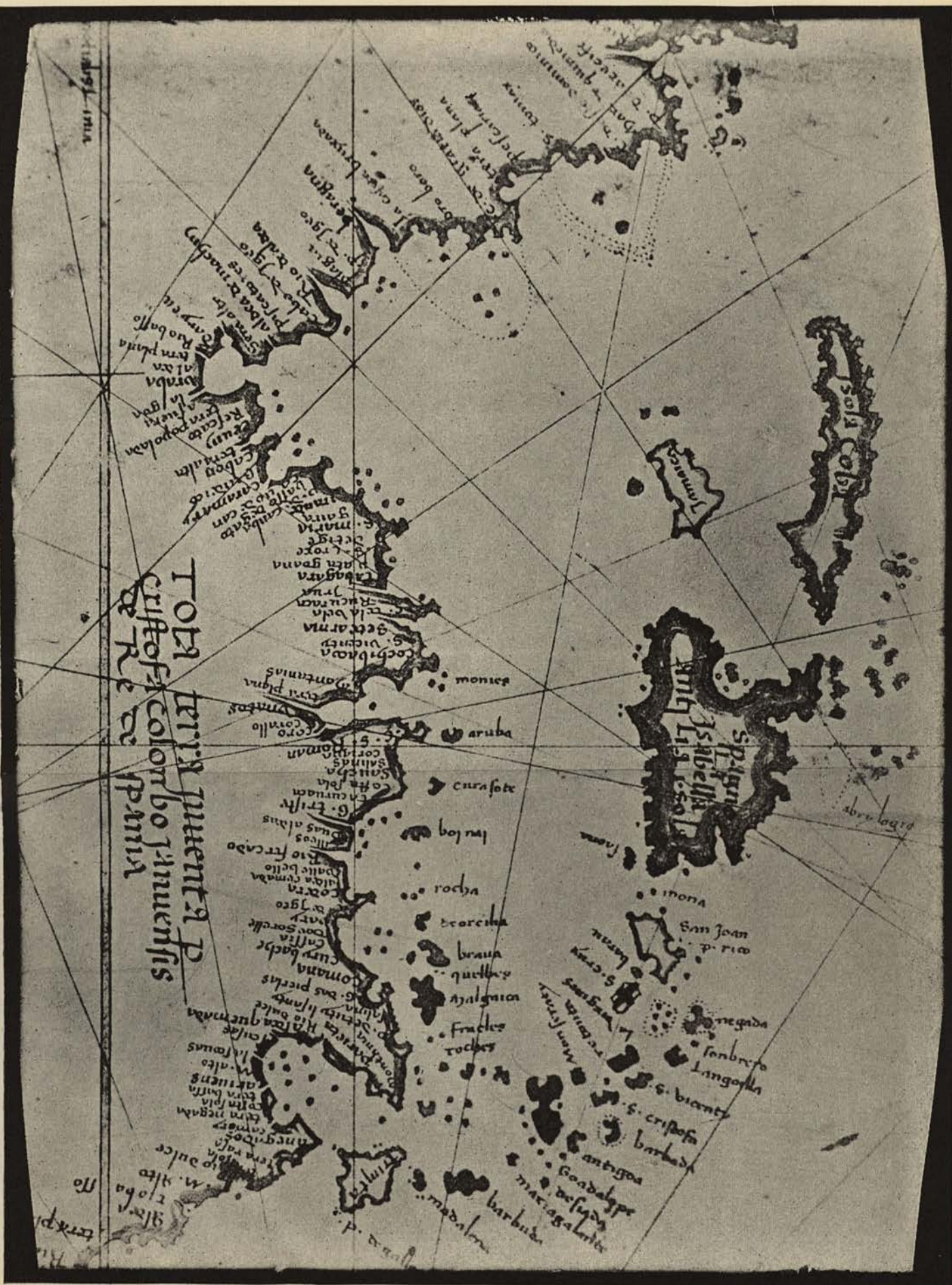
THE WEST INDIES. From the Map of the World of the year 1519, by the Vesconte de Maggioto, in the Royal Library, Munich.